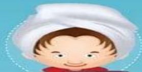
Hair Styling and Cosmetology