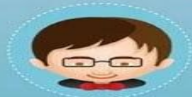
Bookkeeping, Accounting and Auditing