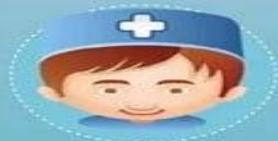
Health Care and Social Assistance